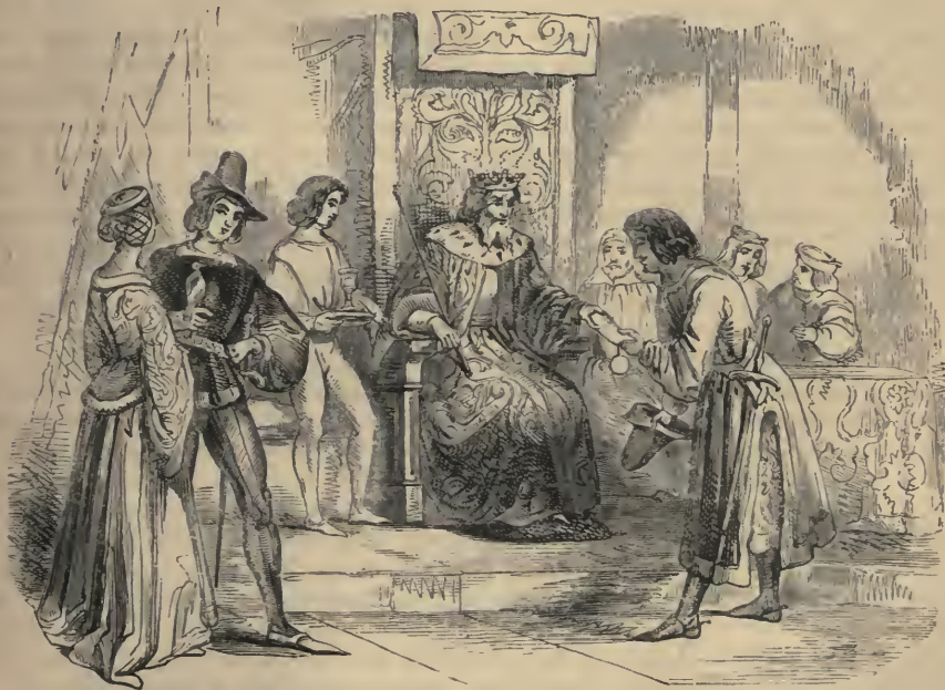
THE EMPEROR CONSTITUTING THE DUKE OF BRABANT LANGUEFRIDE, OR KEEPER OF THE PUBLIC ROADS. Designed from MSS. Illuminations of the Fifteenth Century.